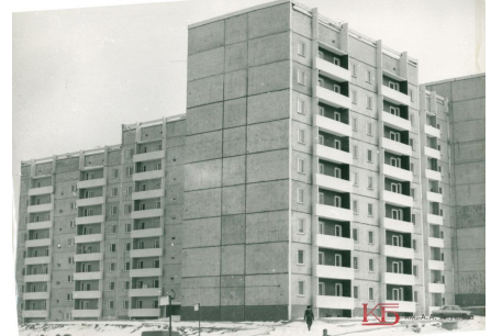
Fig. 1 – Building series 1M-438AC (GeoPortal, 2018).